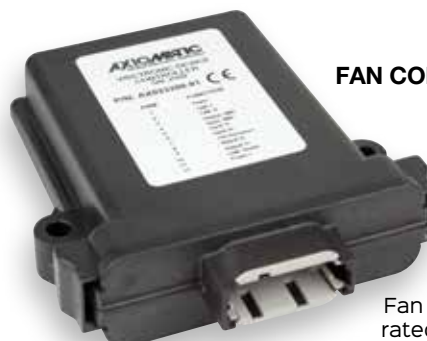
Fan Controller rated for 125°C