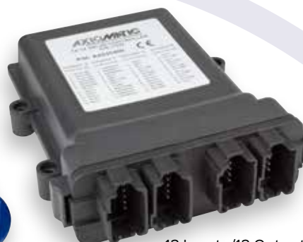
12 Inputs/12 Outputs Valve Controller, SAE J1939