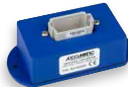
CAN PROTOCOL CONVERTER SAE J1939/ CANopen/Modbus RTU Gateway