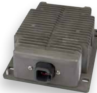
48Vdc/24Vdc Power Converter