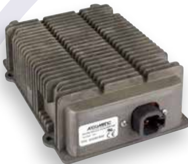
Isolated 24Vdc/24Vdc Power Converter