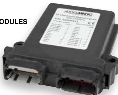
10 Universal Signal Input/ CAN I/O Controller