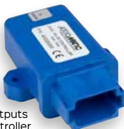
CAN/2 Outputs Valve Controller