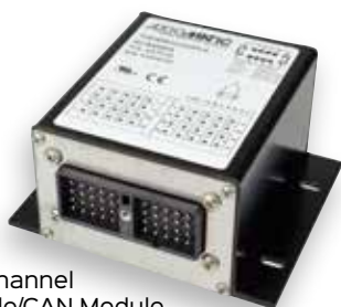
20 Channel Thermocouple/CAN Module