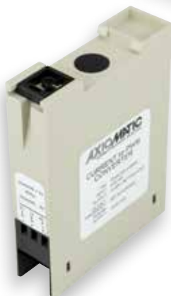
Isolated Dual Channel Signal Converter with CAN

4-20 mA/PWM Signal Converter, DIN rail mount