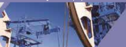
Gas & Oilfield Equipment