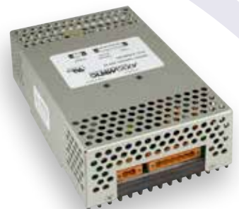
24Vdc/120Vdc Power Converter, 230W, DIN rail Mount