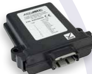
CAN/4 Analog Signal Outputs Controller