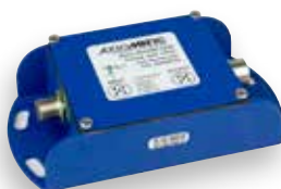
Triaxial Inclinometer with Gyroscope