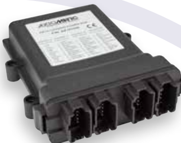
Thermocouple & Analog Inputs/CAN Controller