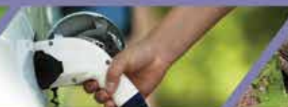
Electric & Hybrid Vehicles